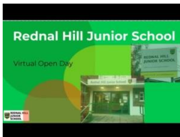
1 - Rednal Hill Junior School virtual open day.

The video can also be found on the school's website by clicking here .